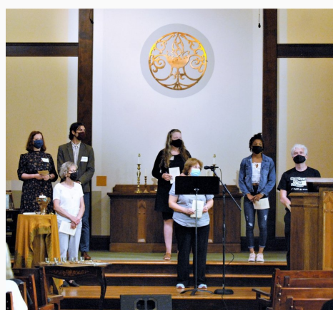
Some of our newest congregation members joining in-person on September 19, 2021.