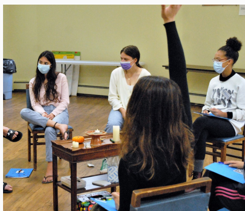
Students participating in our Religious Education program on October 3, 2021.