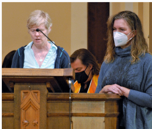
The congregation covenanted with the new chairs of the Social Justice Coordinating Team on October 24, 2021