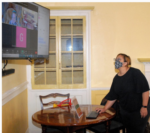
Setting up for those joining Connection Cafe virtually on Sunday.