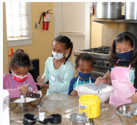
Children participating in our Religious Education Creative Edge class.