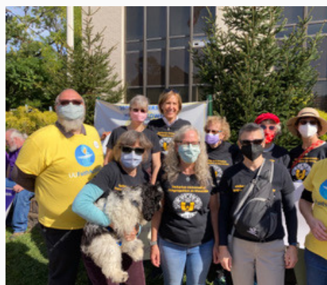
UUCM-ers at the Women's March in Montclair in October.